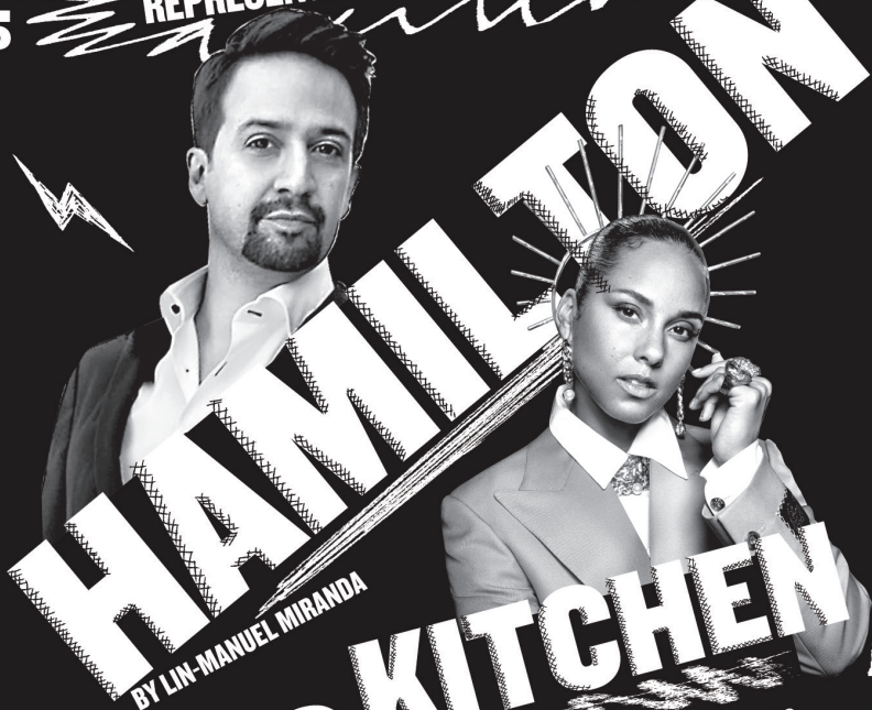
Lin-Manuel Miranda, Alicia Keys, Shaina Taub

THE PUBLIC THEATER IS PROUD TO BE REPRESENTED ON BROADWAY WITH