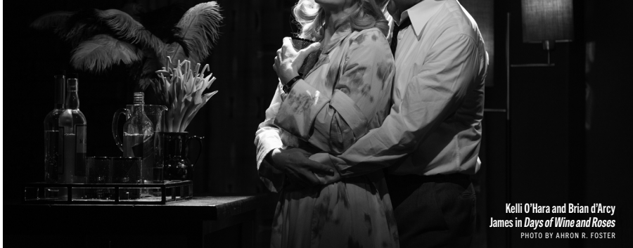
Kelli O'Hara and Brian d'Arcy James in Days of Wine and Roses

How Days of Wine and Roses is a love story, albeit an unhealthy one.