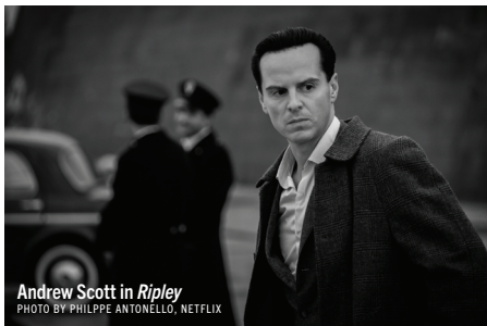
Andrew Scott in Ripley