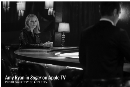
Amy Ryan in Sugar on AppleTV