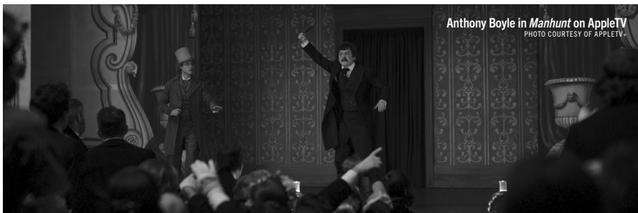
Anthony Boyle in Manhunt on AppleTV