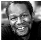
John Douglas Thompson