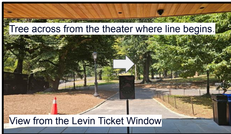
Tree across from the theater where line begins.