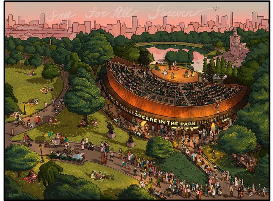
Illustration by David Regone